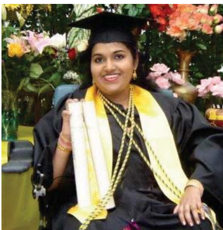
Figure 1: My Graduation Celebration

I also attribute receiving my greatest support at the University of Maryland, Baltimore County (UMBC). UMBC is a wonderful place that not only has high-quality technology research development but professors there want all students to be leaders in their field, regardless of disability. Despite my disability with spinal muscular atrophy, I completed my undergraduate at UMBC dual majoring in computer science and math in 2007. Figure 1 is the celebration of my graduation. Now, I am a PhD student working on research to increase independence for people with disabilities using robotics.